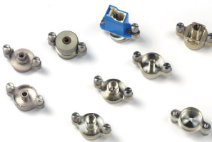
Optical adapters (BN 2014) for power meter output