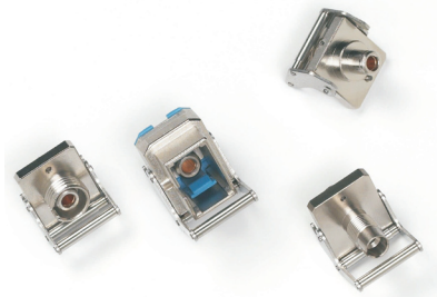
Optical adapters (BN 2150) for laser source output