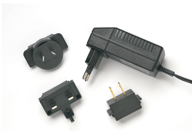
Worldwide compatible AC adapter/charger (SNT-121A)

Additionally, the OLT-55 can be used as a stand-alone power meter or laser source with all features of the corresponding OLS-55 and OLP-55. It creates a new industry standard with its built-in auto-zeroing function for best accuracy even for very low power levels or high loss measurements.